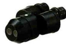
L-1BW GREENOUGH TYPE MICROSCOPE