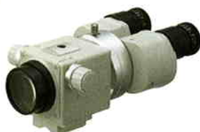
ZS-3-SL ZOOM MAGNIFICATION (10X-30X)