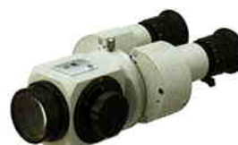
MS-4 5 STEPS MAGNIFICATION (6, 10, 16, 25, 40X)