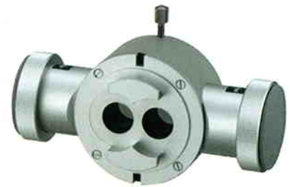
L-0541 BEAM SPLITTER