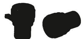
OCL-004 EYE PIECES 12.5X