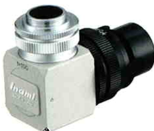
L-0564 TV CAMERA ADAPTER(f=50mm)