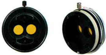
YF-57 SPECIAL ADAPTOR BUILT-IN YELLOW FILTER