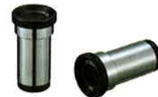
OCL-006 EYE PIECES 10X