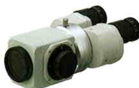
MS-51 3 STEPS MAGNIFICATION (10, 16, 25X)