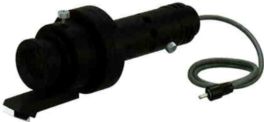
L-0965 OBLIQUE ILLUMINATOR