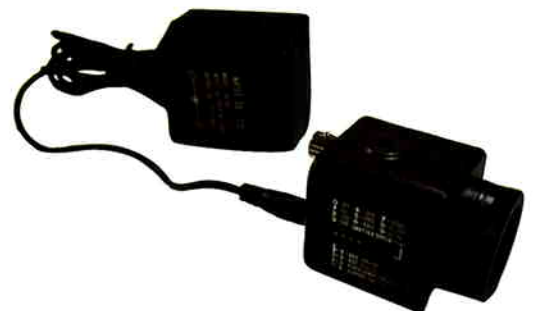
L-0568 CCD CAMERA