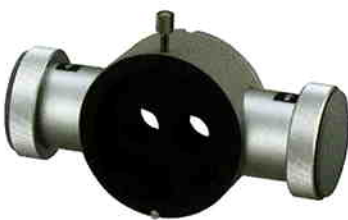
L-0541 BEAM SPLITTER DEVICE

This is designed to be mounted with any kinds of accessory, especially L-0568 Inami CCD Camera device with L-0541 Beam splitter and L-0544/ L-0554TV Camera adaptor