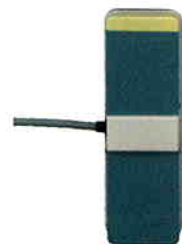
UP/DOWN FOOT SWITCH