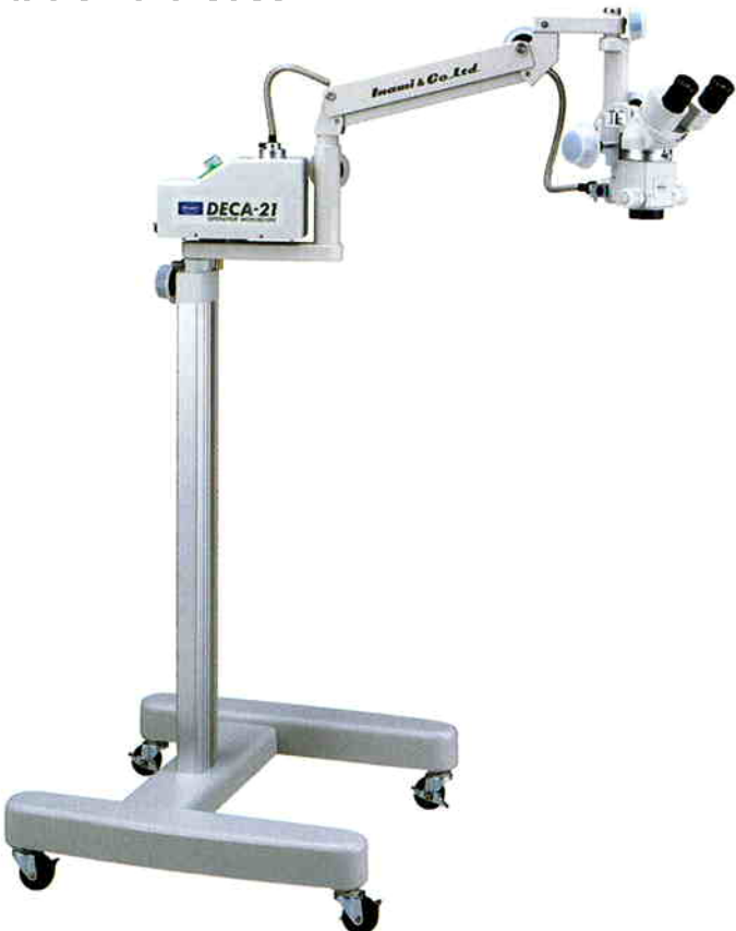
L-0940SD + K-1422