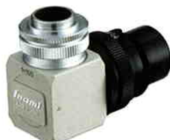
L-0544 (f=100mm) L-0554 (f=70mm) TV CAMERA ADAPTER

This is designed to be mounted with any kinds of accessory, especially L-0568 Inami CCD Camera device with L-0541 Beam splitter and L-0544/ L-0554TV Camera adaptor