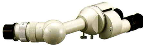
L-0542-C ASSISTANT BINOCULAR MICROSCOPE