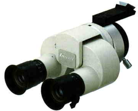
L-0967 ASSISTANT BINOCULAR MICROSCOPE