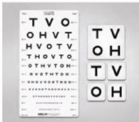
Chart Size: 10' x 18", 25.4 cm x 45.7 cm