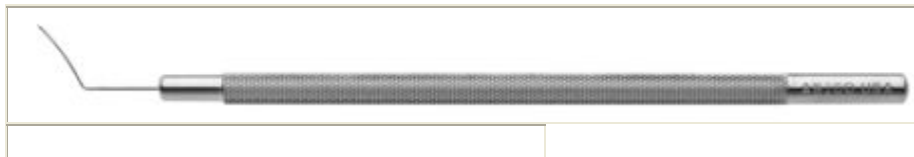
Image of Lehmann Intralase Spatula