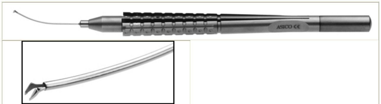
Image of Ikeda II Micro Capsulorrhexis Forceps